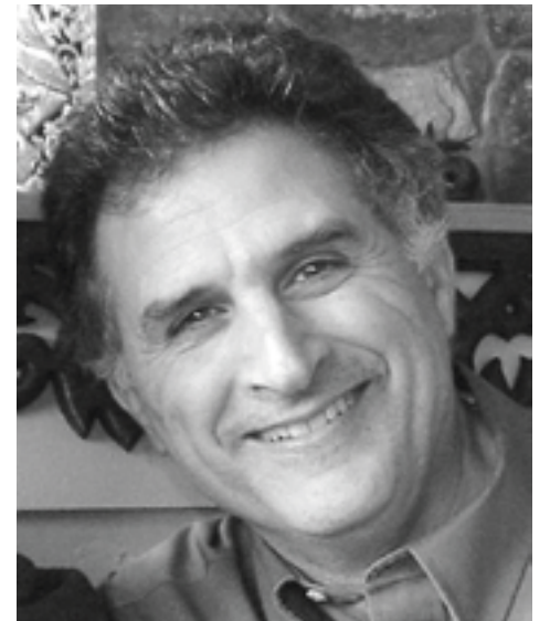
Jack Elias says that when we stop wanting something and start acting as if we already have it, the subconscious mind stops denying us access.

We have been subtly hypnotized to believe that we can't act contrary to our feeling state; we can't act, or even shouldn't, act kindly if we don't feel kindness. Makes sense to most of us, but it actually puts the cart before the horse.